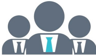
CEO Addressing about Axon

Axon accounting & Bookkeeping encompasses a complete range of plans & solutions for business start-ups and management in Dubai and across the globe. A decade of experience has braced our professional team to develop balanced quality service to suit the particular needs of each of our enthusiastic entrepreneurs. Our customized assistance is the right blend of industry expertise and technology to attain the full purpose of the consulting projects. We are fully aware that complex business issues require careful understanding, proper planning, right selection, correct implementation and objective evaluation. Hence, we strive to serve these comprehensive needs of your enterprise within our complete service range. We provide specialized advisory services in the corporate, commercial, financial, regulatory and administrative matters as well as in the fields of structuring/licensing business and trading/manufacturing development, Real estate in UAE. We proudly present a wide variety of services that is a unique concord of enhanced quality and improved client service.